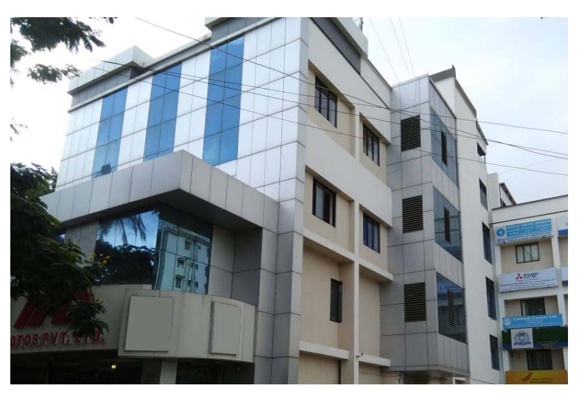
India Coimbatore FA Center office

TOKYO, January 23, 2019 – <u>Mitsubishi Electric Corporation</u> (TOKYO: 6503) announced today that it will establish an "India Coimbatore FA Center" in Coimbatore, in India's Tamil Nadu State. Scheduled to commence operations from February 1, the new facility will further strengthen the service network of the company's factory automation (FA) products in India and facilitate expansion of its FA system business.