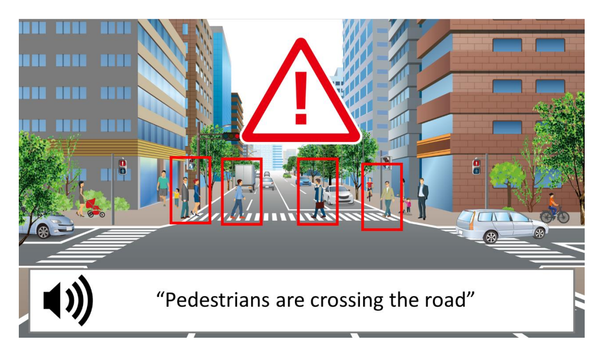
Example of Scene-Aware Interaction providing guidance to avoid hazards